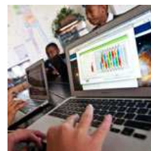
Media Companies See Cash Cow in Education