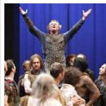
Commands Both Martial and Marital