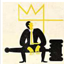
Room for Debate: Less Power for Prosecutors?