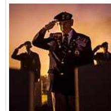
A Day for Canada's Fallen in a Lesser-Known Battle

9. IHT RENDEZVOUS Latin America Sees Hand of Colonialism in Assange Standoff