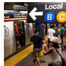
Faulty Subway Sign Mixes Up Colors for Lines